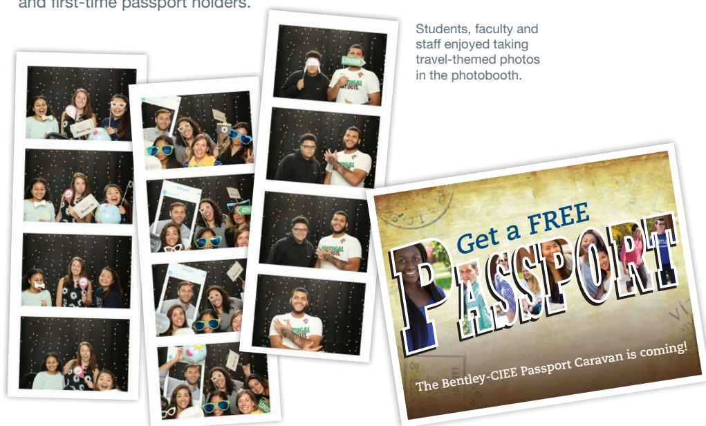
Students, faculty and staff enjoyed taking travel-themed photos in the photobooth.

The Cronin Office of International Education marked Bentley's centennial year with a Passport Caravan event aimed at issuing 100 free passports to Bentley students. In an effort to increase access to study abroad, we partnered with CIEE and the U.S. Department of State to bring a one-stop passport shop to the Student Center on October 18, 2016. Students submitted passport applications, enjoyed global games, talked with study abroad peer advisers, and posted their study abroad goals on a giant map commemorating the event. Many of the passport recipients were first year students and first-time passport holders.