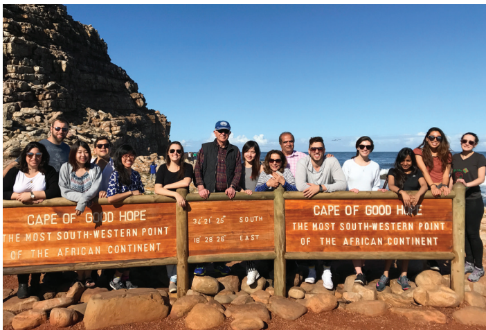
May 2017: GBE 790 Business in South Africa students visit the Cape of Good Hope.

heard about in the news. The people are pure of heart and motivated beyond belief. As a class, we jived with the businesses (small and large) and kept eager questions flowing like the Liesbeeck River while maintaining a courteous yet welcoming demeanor. They taught us that no dream is ever too ludicrous to chase, that truth and bravery are golden rules, and that sometimes all you need is a bit of drumming to liven the mood. Our trip to South Africa will forever be engrained in my memory as the single most rewarding, memorable, and awe-inspiring adventure I’ve taken to date. It was more than just a course in business, it was a lesson in the permanence of humankind.