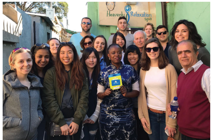
May 2017: GBE 790 Students visit a small business owner in the Alexandria Township.